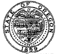
THEODORE R. KULONGOSKI, GOVERNOR

MAILING ADDRESS: OREGON DLCD 635 CAPITOL STREET, NE, STE 150 SALEM, OR 97310